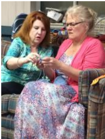
The Knitting Group on Wednesdays

Information on Women's Bulletin Board – may make copies of the registration form.