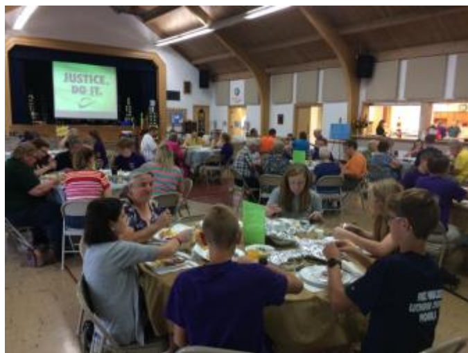
Thank You Luncheon- Sept. 24

Lunch provided. Please remember your Bible. Sign up by Wed., October 11.