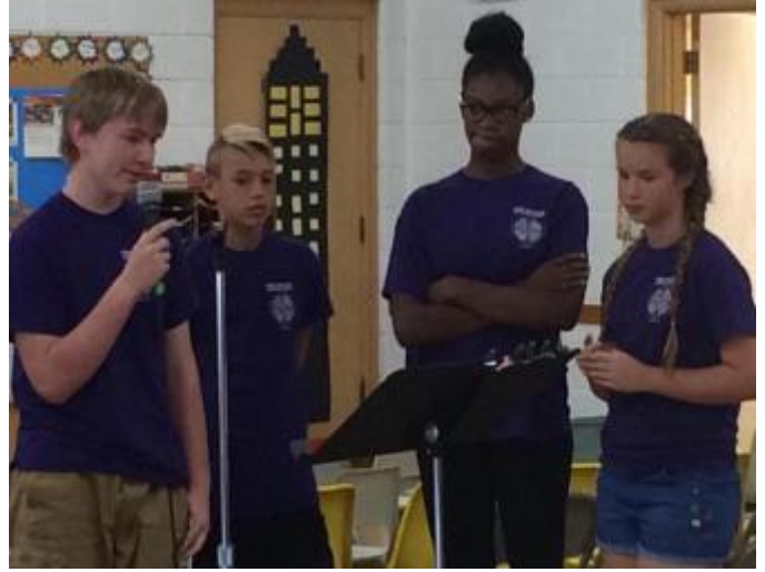
Youth talk about their love for Confirmation Camp at the Thank You Luncheon.

Knitting Group off to a wonderful start.